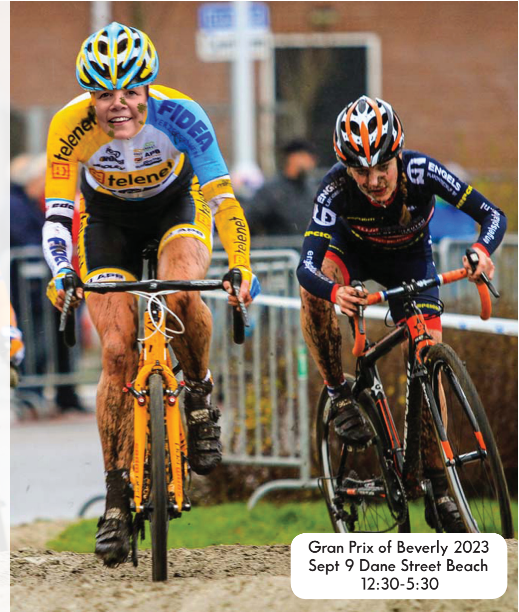
Gran Prix of Beverly 2023 Sept 9 Dane Street Beach 12:30-5:30

GRAN PRIX BEVERLY CYCLO- CROSS EVENT BACK ON BEACH FOR 2023. WATCH PREZ SUE KICK IT UP A NOTCH!!!!!!